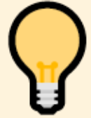
Flash the light