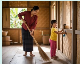
Sweeping / cleaning