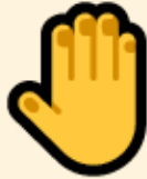
Tap shoulder gently