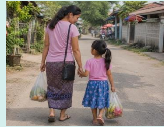
Going to market